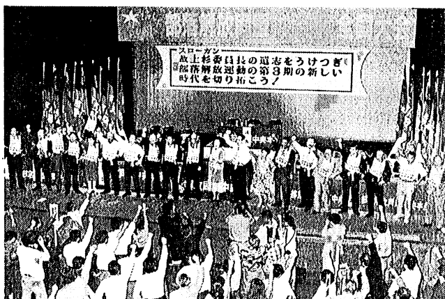
The 53 rd National Convention of the BLL