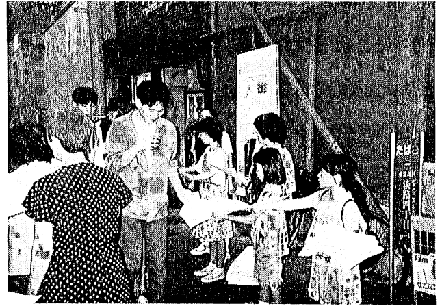
The Leaflets were Distributed

The branch criticized that the graffiti threatened not only Buraku people but also all the people since it agitated prejudice toward Buraku people by maliciously relating them to O-157 in addition to agitating dropping an atomic bomb, of which reference was very