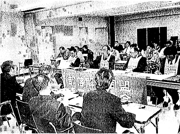
Fact-Finding Session with the Estate Agent