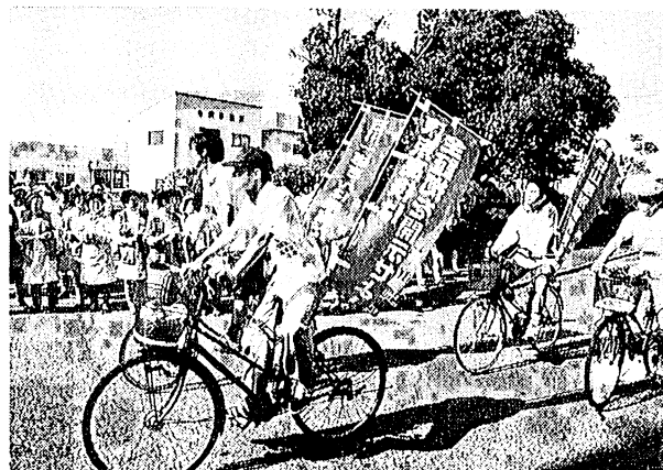
Bicycle demonstration for the Sayama Case

The 53rd National Convention of the Buraku Liberation League