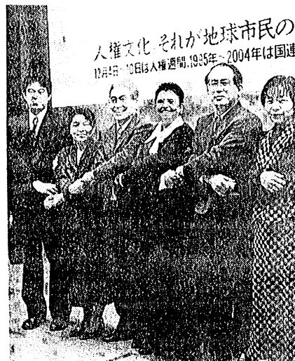
Gathering for the 48 th anniversary of the Universal Declaration of Human Rights in Osaka on December 10, 1996

The scandal with Ricoh Lease, an office equipment leasing company which refused a non-Japanese to be a guarantor in the contract to lease a photocopier, symbolizes